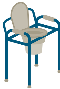
Elevated toilet seat